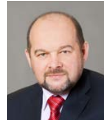
Igor Orlov, Governor of Arkhangelsk Region

The Barents Euro-Arctic Council is an authoritative inter-governmental organization that addresses changing society situations on a timely basis and influences the development of the Northern regions in a positive manner.